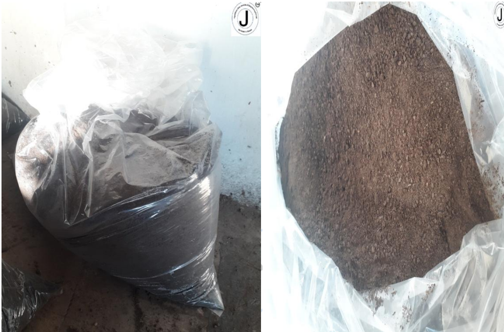
Sample picture of our processed organic manure with 20 kg packaging